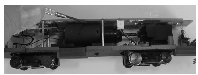
3. Gently pry circuit board off the mounting posts.

2. Start with the rear end. With body spread from step 1, slide a small screwdriver into the truck opening and pull the mechanism out a little. Repeat step 1 and 2 for front end.