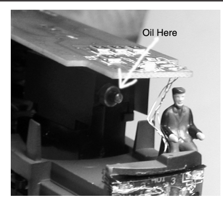
5. Oil both ends of worm shaft (shown) where it passes thru the bearing. Bearing is behind the driver figure in the photo. Also oil other end of shaft.